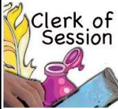
Clerk of Session