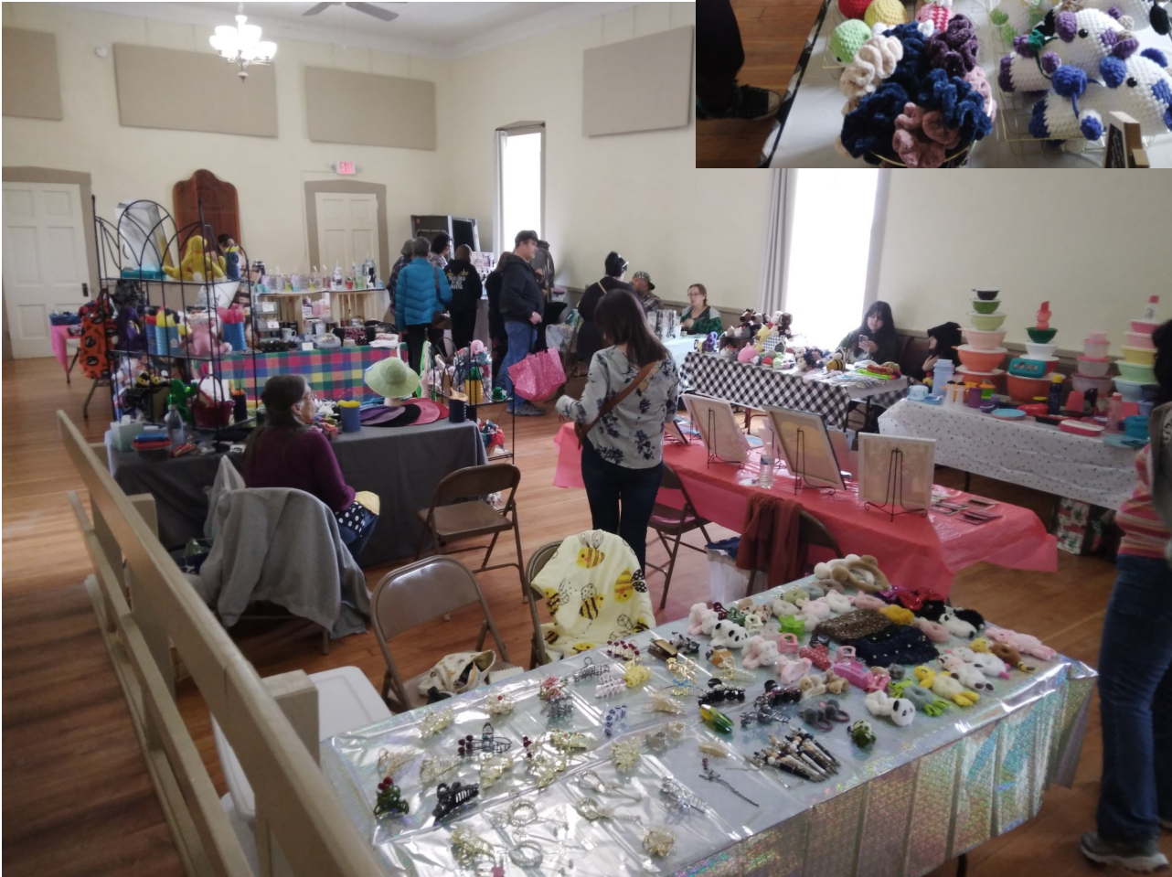
Big room at OTMCC packed with vendors and customers - a very successful day!