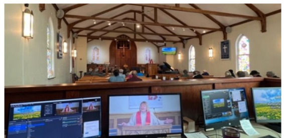
Worship in the sanctuary and on Zoom