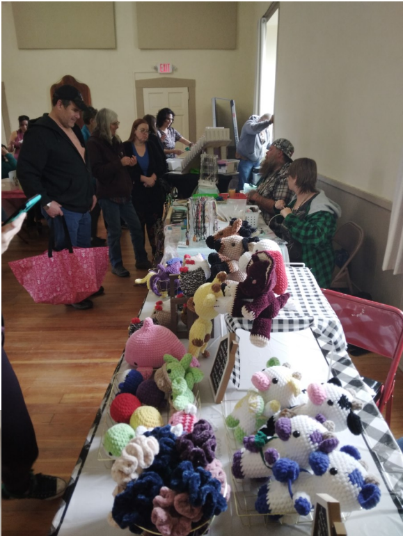
Vendors selling their goods